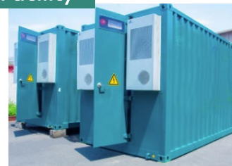
lithium-ion iron-phosphate Battery Module