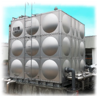
Water Storage Tank